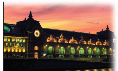
Musée d'Orsay, Paris