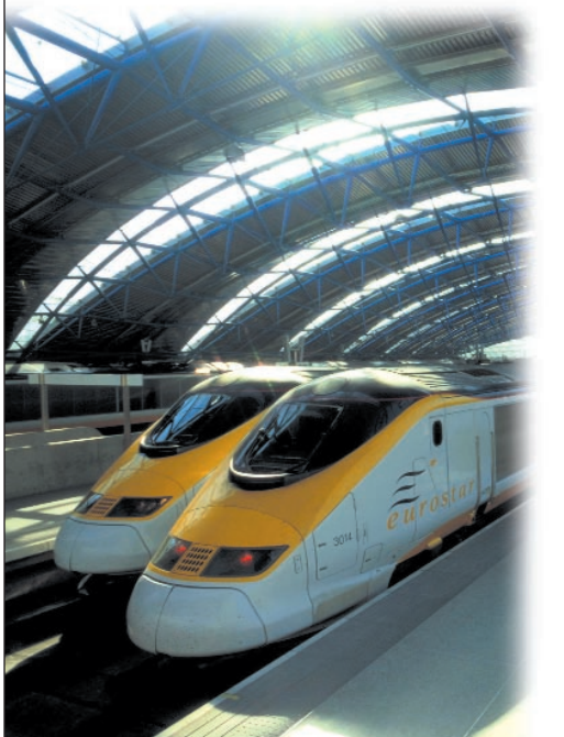
Eurostar trains at Waterloo Station, London

Eurostar tickets booked to/from Brussels can be used for connecting journeys to/from any Belgian station at no additional charge (excludes travel on Thalys). Travel to Belgium and help them celebrate 175 years.