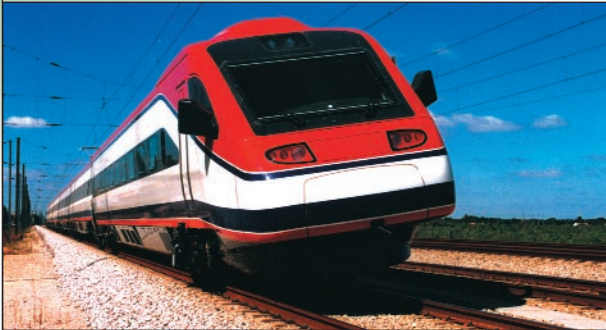
Portuguese Alpha train

See the lands that were once the center of European power and exploration. The crossroads for many different religions and civilizations, Spain and Portugal are a fascinating blend of Moorish, Christian and Jewish influences. Come experience for yourself the history and architecture of the Old World.