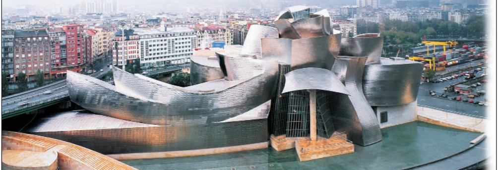
Guggenheim Museum, Bilbao, Spain

Special passholder fares on AVE www.raileurope.com