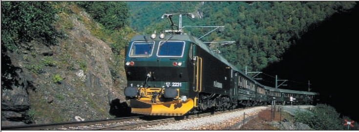
The Flåm Railway, Norway