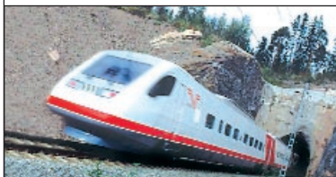
Pendolino tilting train, Finland

Children 6-16: half adult fare when travelling with parent. Under 6: free.