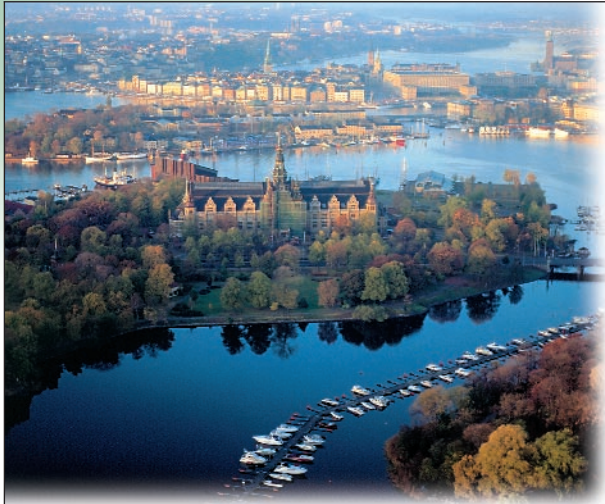
Djurgården, Stockholm, Sweden

Let the dramatic landscapes of Denmark, Finland, Norway and Sweden take your breath away. Be charmed by Scandinavia's picturesque villages and warmhearted people. The Scanrail Pass will enable you to easily enjoy everything Scandinavia has to offer.