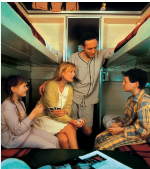
Typical 1st Class/2nd Class quadruple sleeper accommodations