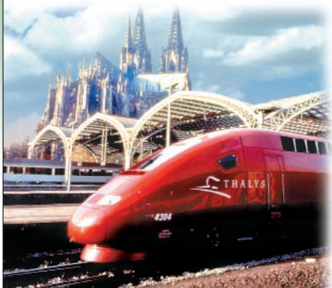
Thalys high-speed train near Cologne cathedral, Germany

Every European train station has its own personality – from historic to ultra-modern. Most are centrally located and offer a full range of services, including information desks, gift shops, luggage carts, ATMs, postal services, restaurants, telephones and currency exchanges. For help, simply look for the “i” – the universal symbol for information.